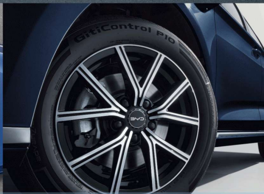
17-inch Star-Like Alloy Wheels