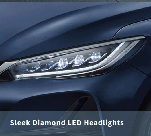
Sleek Diamond LED Headlights